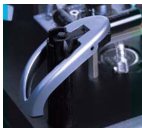
Avant architect in-wall SmartLoc™

SmartLoc is unique to Avant architect™. This patent-pending clamping system enables quick and easy mounting with minimal disruption to existing décor. The entire range can be accommodated in virtually all partition walls without the need for fitting