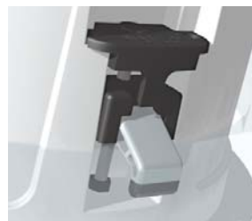
Our in-ceiling SmartLoc™ system offers quick and easy installation

accessories or a separate mounting kit. A mechanical isolation system prevents re-radiation from the mounting wall – so often a problem with custom install designs – allowing the drivers to operate to their full potential whatever their situation.